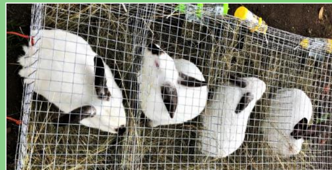
Pure breed Carlifornian rabbits ready for distribution